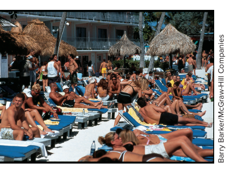
Is your flight to Fort Lauderdale "free" if you travel on a frequentflyer coupon?

The Cost-Benefit Principle tells us that you should go to Fort Lauderdale if the benefits of the trip exceed its costs. If not for the complication of the frequent-flyer coupon, solving this problem would be a straightforward matter of comparing your benefit from the week at the beach to the sum of all relevant costs. And since your airfare and other costs would add up to $1,500, or $150 more than your benefit from the trip, you would not go to Fort Lauderdale.