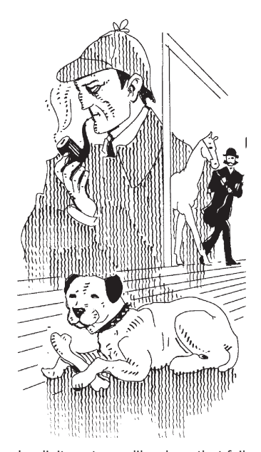
Implicit costs are like dogs that fail to bark in the night.

The opportunity cost of an activity, once again, is the value of all that must be forgone in order to engage in that activity. If buying a computer game downtown means not watching the last hour of a movie, then the value to you of watching the end of that movie is an implicit cost of the trip. Many people make bad decisions because they tend to ignore the value of such forgone opportunities. To avoid overlooking implicit costs, economists often translate questions like "Should I walk downtown?" into ones like "Should I walk downtown or watch the end of the movie?"